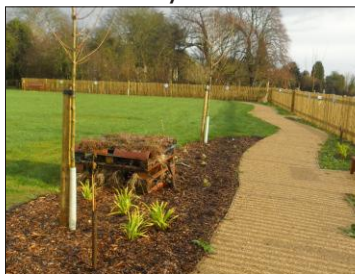
Bug hotel in wildlife garden