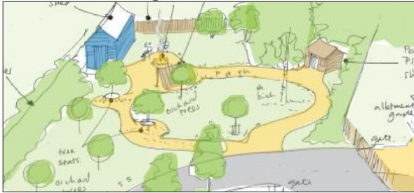
April 2011: Concept sketch for orchard & den building area