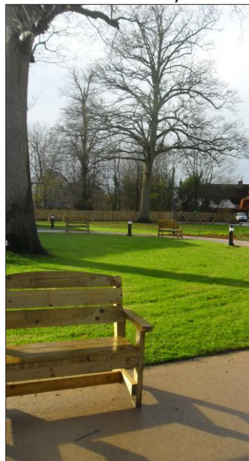
December 2011 - entrance to school