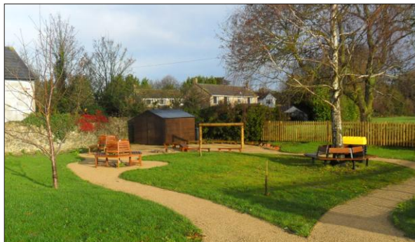
The concept made real