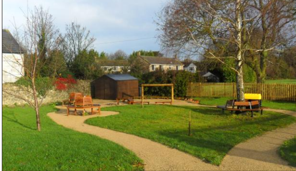
The concept made real