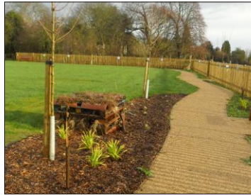
Bug hotel in wildlife garden