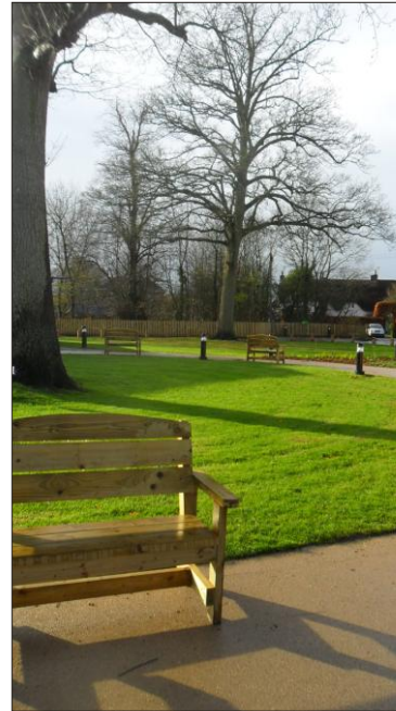
December 2011 - entrance to school