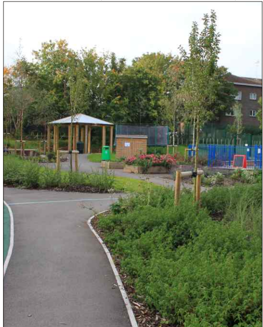
Cycle/wheel play route - New Siblands gardens