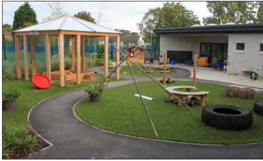
The reception garden for the two schools