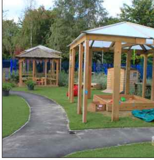
Artificial grass for year round access