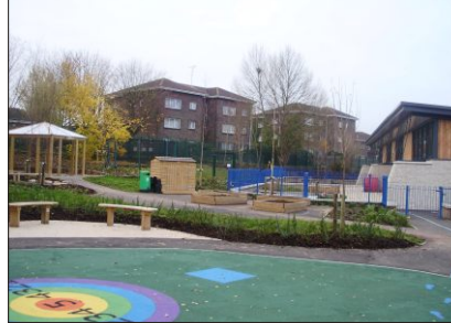
Gillingstool & Siblands Primary School