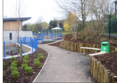
Gillingstool & Siblands Primary School