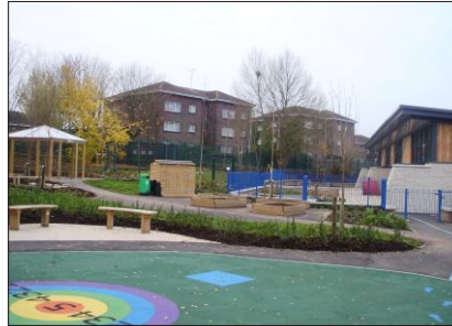
Gillingstool & Siblands Primary School