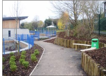
Gillingstool & Siblands Primary School