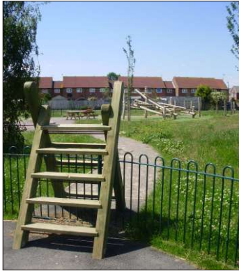
Byon Rec - completion